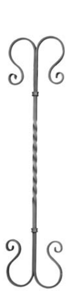
H.850 X L.200 mm. Art. 07.023 □12 ≙ 12 X 6