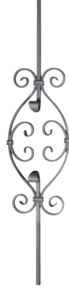
H.950 X L.215 mm. Art. 07.016 □12 ≙ 12 X 6