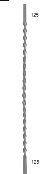
Rigato / Fluted H.950 mm. Art. 07.052 20 x 12