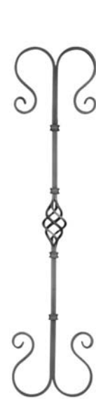
H.850 X L.200 mm. Art. 07.022 □12 ≙ 12 X 6