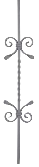
H.950 X L.170 mm. Art. 07.017 □12 ≙ 12 X 6