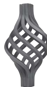
H.245 X L.130 mm. Art. 02.088 □ 30 X 30