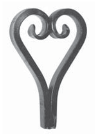
Liscio / Smooth H. 190 x L. 120 mm Art. 02.200 □ 16 mm Art. 02.200.01 □ 20 mm