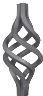
H.210 X L.90 mm. Art. 02.083 □ 20 X 20