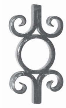
Liscio / Smooth H. 240 x L. 135 mm Art. 02.207 □ 16 mm

La riproduzione, anche se solo parziale, del presente catalogo, è vietata. Total or partial reproduction of this catalogue is not permitted.