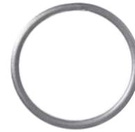
Cerchi con sezione in tondo e tondo martellato Round section circles and hammered circles

(N.B.: Tutti i cerchi non sono saldati.) (NOTE: All the circles are not welded.) H= Diametro esterno/ External Diameter