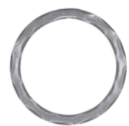
Martellato Hammered \square 12 X 12 mm. Art. 02.077.22 H 100 mm. Art. 02.077.23 H 110 mm. Art. 02.077.24 H 120 mm. Art. 02.077.25 H 180 mm. Mart. a caldo / Hot hammered \square 14 X 14 mm. Art. 02.077.26 H 100 mm. Art. 02.077.27 H 110 mm. Art. 02.077.28 H 115 mm. Art. 02.077.29 H 120 mm. Art. 02.077.30 H 125 mm. Art. 02.077.31 H 130 mm. Art. 02.077.32 H 135 mm. Art. 02.077.33 H 130 mm. Art. 02.077.34 H 160 mm. Art. 02.077.35 H 180 mm. Art. 02.077.36 H 250 mm. Mart. a caldo / Hot hammered \square 16 X 16 mm. Art. 02.077.37 H 100 mm. Art. 02.077.38 H 110 mm. Art. 02.077.39 H 120 mm. Art. 02.077.40 H 135 mm. Art. 02.077.41 H 140 mm. Art. 02.077.42 H 180 mm. Art. 02.077.43 H 250 mm.