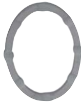
H.175 X L.130 mm. Art. 02.055 \square 12 X 12