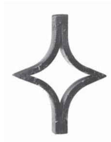
Liscio / Smooth H. 185 x L. 155 mm Art. 02.205 □ 16 mm