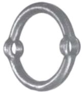
Foro Ø 14 mm Hole Ø 14 mm Ø 14 mm. Art. 02.065.13 H 110 mm. Art. 02.065.14 H 125 mm