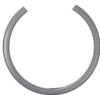
Cerchio aperto sezione in quadro Open circle square section