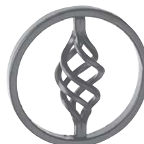
H.100 X L.100 mm. Art. 02.130 ≧ 14 X 6 □ 4 X 4