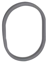
H.160 X L.120 mm. Art. 02.048 \approx 16 X 8