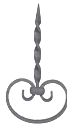
Mod. Scala / Scala Model H.235 X L.125 mm. Art. 02.057 \approx 12 X 6 Art. 02.058 \approx 14 X 6