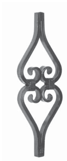
Liscio / Smooth H. 380 x L. 120 mm Art. 02.201 □ 16 mm