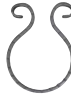
Mod. Scala / Scala Model H.160 X L.110 mm. Art. 02.064 \approx 12 X 6 Art. 02.065 \approx 14 X 6