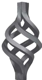
H.210 X L.110 mm. Art. 02.084 □ 24 X 24 Martellato / Hammered Art. 02.084.01 □ 24 X 24