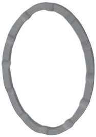
H.270 X L.190 mm. Art. 02.054 \square 14 X 14