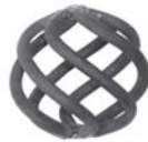
H.70 X L.70 mm. Art. 02.063.05 \emptyset 6 - 6 Traf. / Elem.