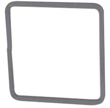
H.200 X L.200 mm. Art. 02.051 \square 8 X 8 Art. 02.052 \square 10 X 10 Art. 02.053 \square 12 X 12