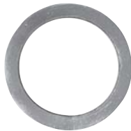
Cerchi con sezione in quadro Square section circles