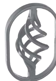
H.160 X L.105 mm. Art. 02.140 ≧ 14 X 6 □ 6 X 6