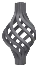
H.190 X L.105 mm. Art. 02.087 □ 24 X 24