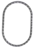
Ovale Piatto Modello Scala Scala Model Flat Oval H.160 X L.100 mm. Art. 02.048.01 \approx 12 X 6 Art. 02.048.02 \approx 14 X 6 Art. 02.048.03 \approx 16 X 6