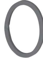
H.160 X L.115 mm. Art. 02.050 \square 12 X 12