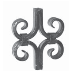
Liscio / Smooth H. 155 x L. 135 mm Art. 02.203 □ 16 mm Art. 02.203.01 □ 20 mm