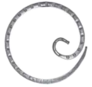
Piatto Modello Scala Flat Scala Model \approx 12 X 6 mm. Art. 02.065.07 H 100 mm. Art. 02.065.08 H 120 mm. \approx 14 X 6 mm. Art. 02.065.09 H 100 mm. Art. 02.065.10 H 120 mm. \approx 16 X 6 mm. Art. 02.065.11 H 100 mm. Art. 02.065.12 H 120 mm.