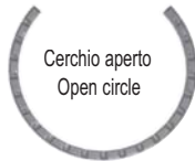
Cerchio aperto Open circle Piatto Modello Scala Flat Scala Model \approx 12 X 6 mm. Art. 02.066 H 100 mm. Art. 02.066.01 H 110 mm. Art. 02.067 H 120 mm. Art. 02.068 H 130 mm. Art. 02.068.01 H 150 mm. \approx 14 X 6 mm. Art. 02.069 H 100 mm. Art. 02.069.01 H 110 mm. Art. 02.070 H 120 mm. Art. 02.071 H 130 mm. Art. 02.071.01 H 150 mm. \approx 20 X 6 mm. Art. 02.071.02 H 100 mm. Art. 02.071.03 H 110 mm. Art. 02.071.04 H 120 mm. Art. 02.071.05 H 130 mm. Art. 02.071.06 H 150 mm