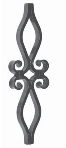
Liscio / Smooth H. 470 x L. 120 mm Art. 02.204 □ 16 mm