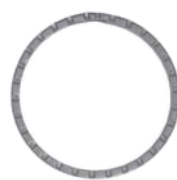
Piatto Modello Scala Flat Scala Model \approx 12 X 6 mm. \approx 20 X 6 mm. Art. 02.072 H 100 mm. Art. 02.073 H 120 mm. Art. 02.074 H 130 mm. Art. 02.074.01 H 80 mm. Art. 02.074.02 H 90 mm. Art. 02.074.03 H 105 mm. Art. 02.074.04 H 110 mm. Art. 02.074.05 H 115 mm. Art. 02.074.06 H 125 mm. Art. 02.074.07 H 150 mm. Art. 02.074.08 H 250 mm. \approx 14 X 6 mm. Art. 02.075 H 100 mm. Art. 02.076 H 120 mm. Art. 02.077 H 130 mm. Art. 02.077.01 H 80 mm. Art. 02.077.02 H 90 mm. Art. 02.077.03 H 105 mm. Art. 02.077.04 H 110 mm. Art. 02.077.05 H 115 mm. Art. 02.077.06 H 125 mm. Art. 02.077.07 H 150 mm. Art. 02.077.08 H 250 mm.