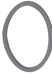
H.240 X L.170 mm. Art. 02.049 \square 14 X 14