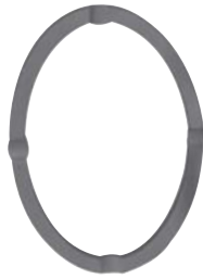
H.250 X L.175 mm. Art. 02.056 \square 14 X 14