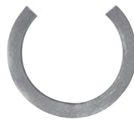
Cerchio aperto sez. in quadro Open circle flat section