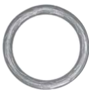
Tondo Lavorato Worked Round Bar Ø 14 mm. Art. 02.065.15 H 100 mm. Art. 02.065.16 H 110 mm. Art. 02.065.17 H 120 mm.