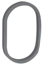
H.200 X L.125 mm. Art. 02.044 \approx 12 X 6 H.160 X L.100 mm. Art. 02.045 \approx 16 X 8 Art. 02.045.01 \approx 12 X 6 Art. 02.045.02 \approx 14 X 6 H.140 X L.100 mm. Art. 02.046 \approx 16 X 8 H.190 X L.130 mm. Art. 02.047 \approx 20 X 4