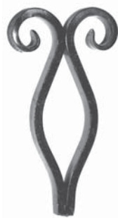
Liscio / Smooth H. 235 x L. 120 mm Art. 02.202 □ 16 mm