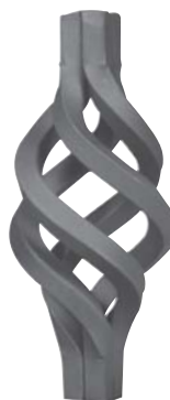
H.240 X L.115 mm. Art. 02.085 □ 30 X 30